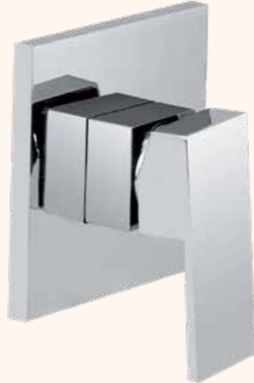
Chrome wall mixer