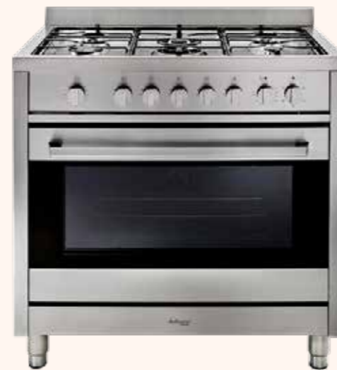
900mm stainless steel upright cooker