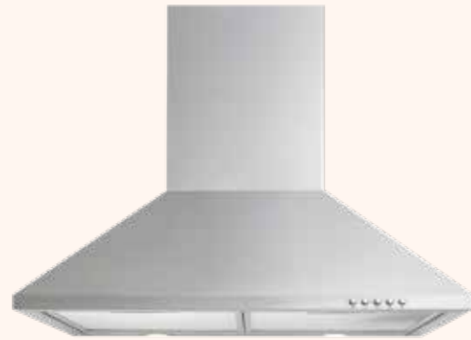
900mm stainless steel rangehood.

At Kincaid our standard inclusions from trusted brands and premium suppliers deliver a superior level of quality, sophistication and comfort that others consider upgrades.