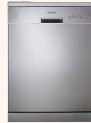
600mm stainless steel dishwasher