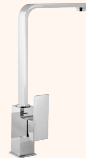
Chrome mixer tap