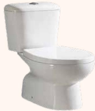
Vitreous china dual flush toilet