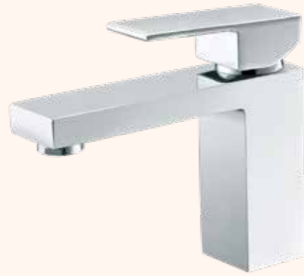
Chrome Basin Mixer

At Kincaid our standard inclusions from trusted brands and premium suppliers deliver a superior level of quality, sophistication and comfort that others consider upgrades.