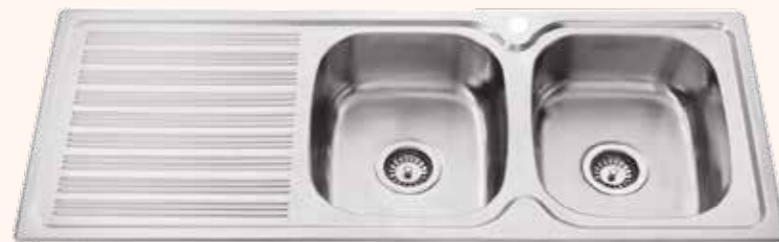
Double bowl stainless steel sink with side drainer