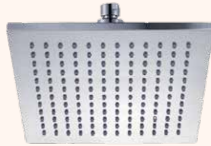
Chrome shower head