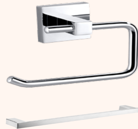
Chrome towel rail and toilet roll holder